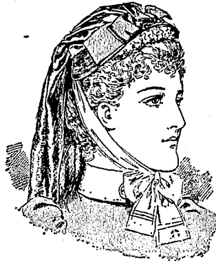
The "St. Bride's" Bonnet. Made of fine Straw with Lace and ruching, and trimmed with Ribbon, and long Silk Gossamer Fall. In black and colours, 12/6 each. Without Fall, 9/6; also The "St. Clare" Bonnet. 6/11 complete.